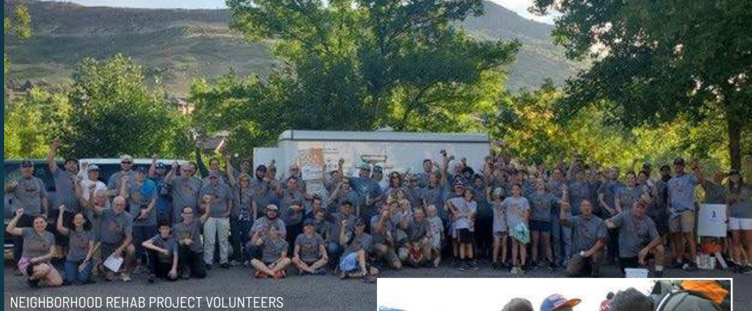
NEIGHBORHOOD REHAB PROJECT VOLUNTEERS

From seeing a need, to creating a vision, our story was woven together through the selfless work, time and donations of countless people. People, who shared a love of Golden and nurtured a common belief that we are together for the benefit of everybody. That vision echoes through our community to this day and guides us in everything we do.