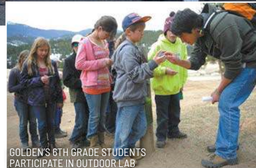
GOLDEN'S 6TH GRADE STUDENTS PARTICIPATE IN OUTDOOR LAB